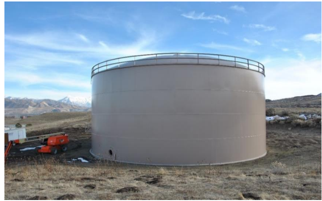
JVWTP Backwash Tank Exterior