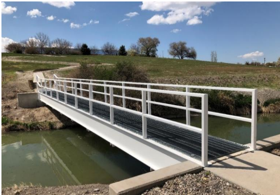
Headquarters Pedestrian Bridge on North Jordan Canal