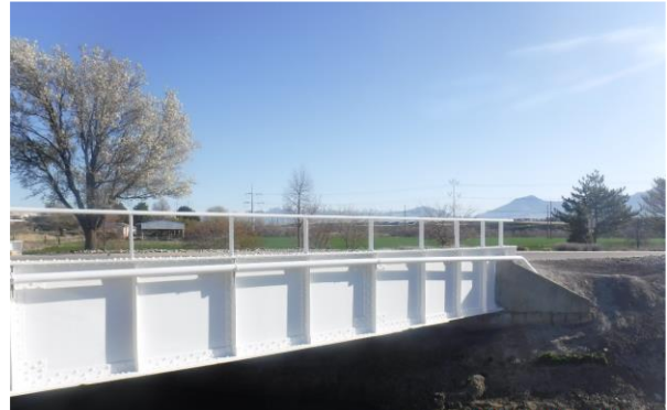
Headquarters Vehicular Bridge on North Jordan Canal