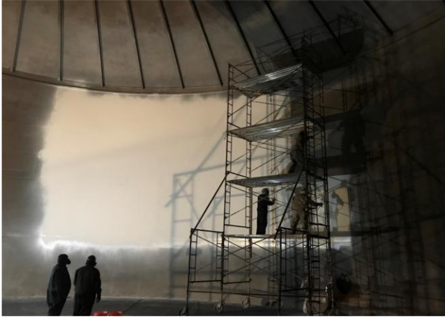
JVWTP Backwash Tank - Interior Work