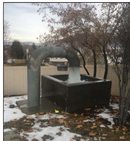
Testing new pump