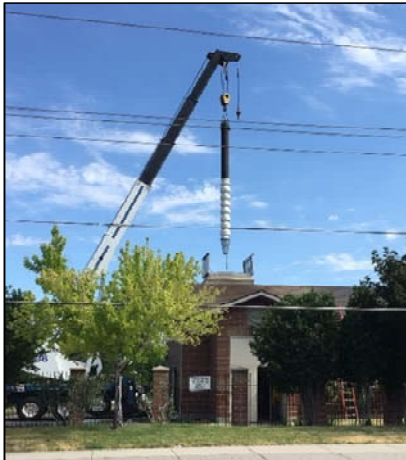
Installing new pump