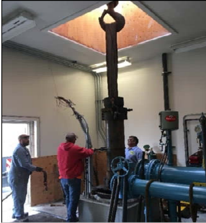
Removing existing column pipe