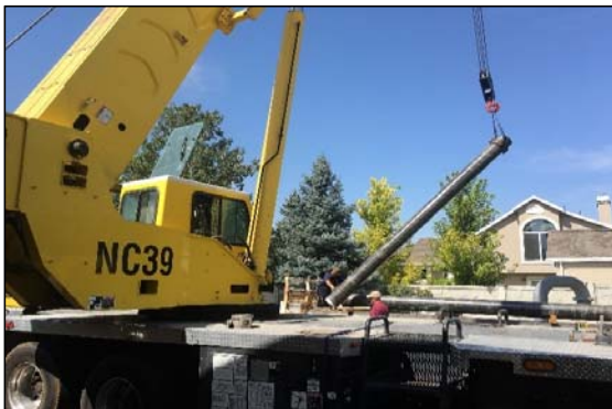
Crane off-loading column pipe