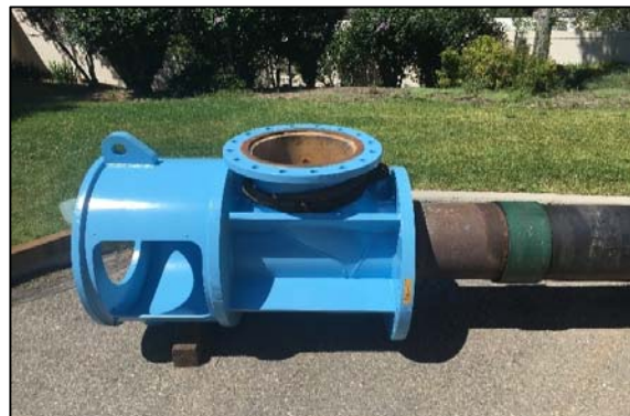
Pump discharge head