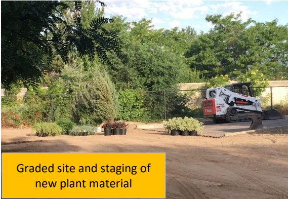
Graded site and staging of new plant material