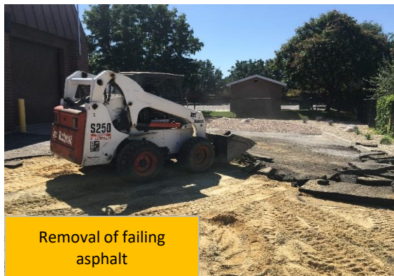
Removal of failing asphalt