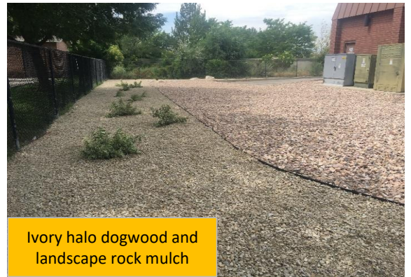
Ivory halo dogwood and landscape rock mulch